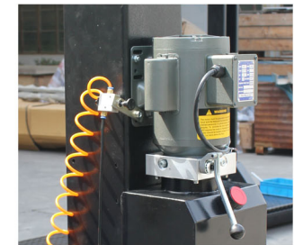
Air Lock Release System