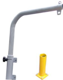
Impact Wrench Kit (optional)